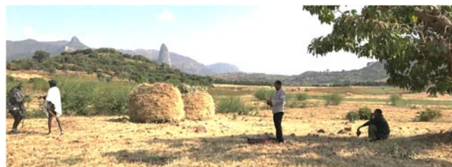
GeoNutrition soil and crop sampling in a teff field in Amhara, November 2017

A final exciting development to report is a new project, funded by the Bill & Melinda Gates Foundation, called GeoNutrition . The work is based in Ethiopia and Malawi. The aim of GeoNutrition is to provide new evidence to support policy makers in the agriculture and public health sectors of Ethiopia, Malawi, and the wider region. This will include new, spatially-informed evidence on the prevalence and causes of MNDs, with selenium as a major focus. The team will also study the potential effectiveness of biofortification strategies to contribute to alleviating Se and Zn deficiencies through application of micronutrient-containing fertilisers. Food system interventions that act through agriculture are likely to play an important role in improving nutrition, especially among rural and marginalised groups.